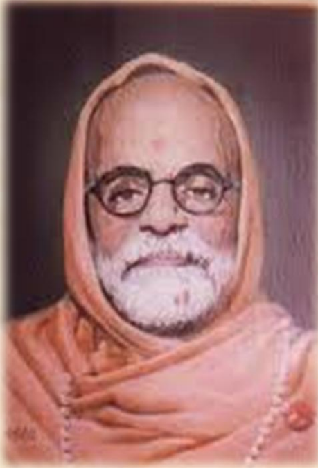
Swami Bharati Krshna Tirtha Ji Maharaj (1884-1960)

For previous issues and further more information visit at www.vedicganita.org