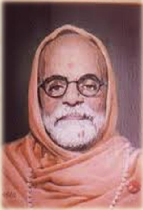
Swami Bharati Krshna Tirtha Ji Maharaj (1884-1960)

For previous issues and further more information visit at www.vedicganita.org