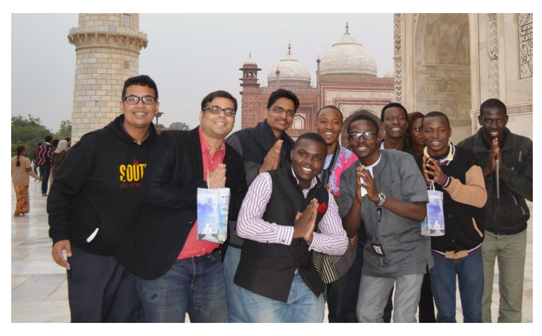
The Vedic Math Forum India Worlds Fastest Mental Math System <a href="http://www.vedicmathsindia.org">http://www.vedicmathsindia.org</a>