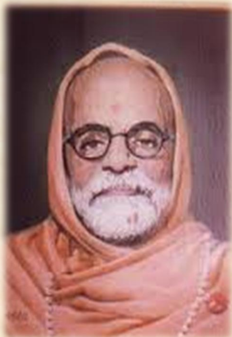
Swami Bharati Krshna Tirtha Ji Maharaj (1884-1960)

For previous issues and further more information visit at www.vedicganita.org