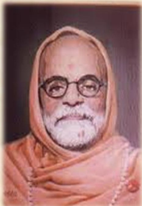
Swami Bharati Krshna Tirtha Ji Maharaj (1884-1960)

For previous issues and further more information visit at www.vedicganita.org